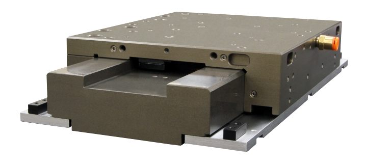
ABL1000 series stages shown in an XY assembly configuration.

ABL1000 series stages are the highest performance miniature air-bearing stages available. Aerotech has combined industry-leading precision motion control and positioning system experience with the latest technologies to produce a truly outstanding miniature, linear air-bearing stage.